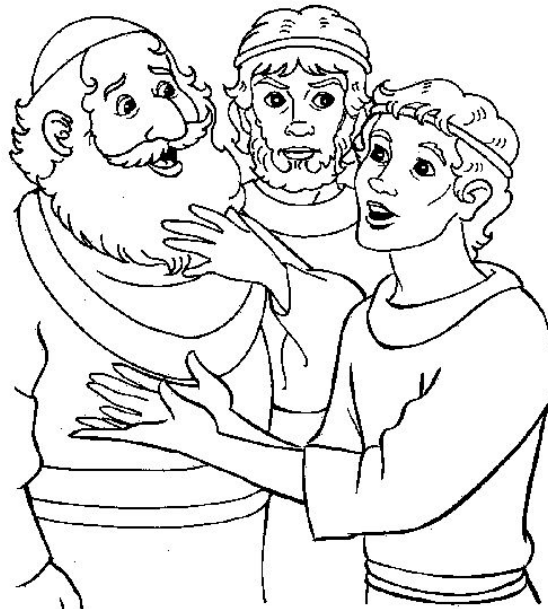
THE PRODIGAL SON Luke 15

"A man had two sons. The youngest said, 'Give me my part of your riches.' The son left, and spent all of his money foolishly."